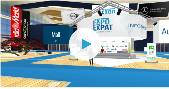
WATCH THE PRESENTATION TRAILER OF THE MALL

Diplomat? New expat in Brussels? Working for an Embassy, ministry or an International Organization?